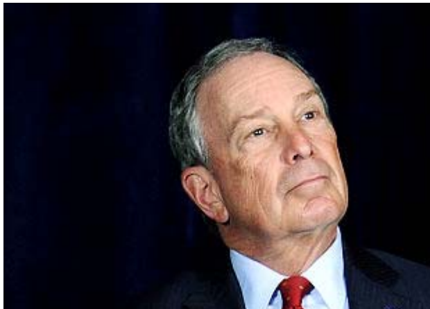
Mayor Bloomberg kicks off three-day volunteering conference on good deeds Monday.

Mayor Bloomberg and other Big Apple bigwigs will celebrate good deeds Monday during a three-day national conference on volunteering being held in Manhattan for the first time.